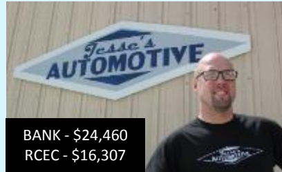
BANK - $24,460 RCEC - $16,307