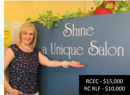
RCEC - $15,000 RC RLF - $10,000