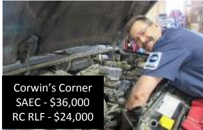
Corwin's Corner SAEC - $36,000 RC RLF - $24,000