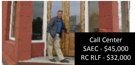
Call Center SAEC - $45,000 RC RLF - $32,000