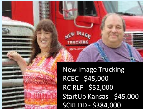
New Image Trucking RCEC - $45,000 RC RLF - $52,000 StartUp Kansas - $45,000 SCKEDD - $384,000