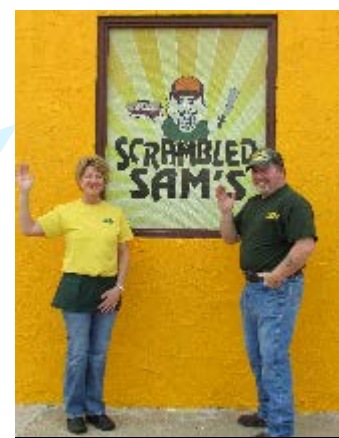
Breakfast Restaurant BANK - $52,000 RCEC - $40,000 RC RLF - $5,000