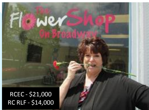
RCEC - $21,000 RC RLF - $14,000