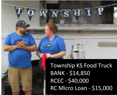
Township KS Food Truck BANK - $14,850 RCEC - $40,000 RC Micro Loan - $15,000